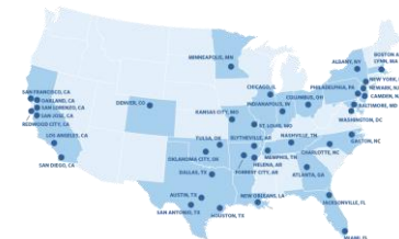
KIPP's National Network

In addition, Frederick Douglass students have an opportunity to gain a global perspective through world travel. In recent years, students from FDHS have traveled to Paris, Panama, and Belize. They are planning future trips to Ghana and Japan. Building this global perspective through real-life experience is an essential part of the Frederick Douglass curriculum and mission.