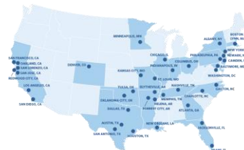
KIPP's National Network